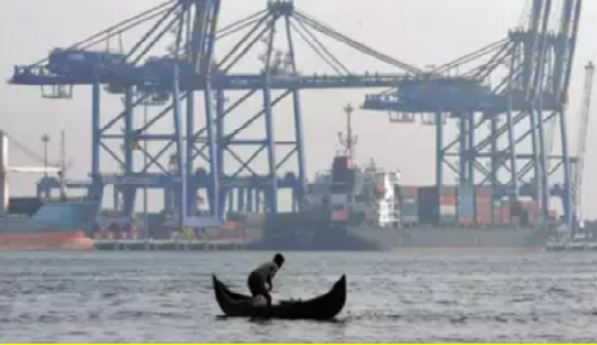
Proposed port will have the ultimate capacity to handle 16 million containers per year

The project is located on the international trade route, with existing transshipment terminals like Singapore, Klang and Colombo in proximity. The project focuses on three key drivers, which can result in making it a leading container transshipment port strategic location in terms of proximity (40 nautical miles) with the international shipping trade route, availability of natural water depth of over 20m and carrying capacity of transshipment cargo from all the